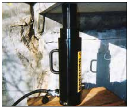
◀ The portable lock nut cylinder RACL-1506 used for extended load supports during epoxy injection for bridge reinforcement.