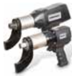
Pneumatic and Electric Torque Wrenches