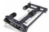
Flange Puller Sets