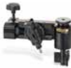
Flange Face Tool