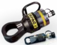
Hydraulic Nut Cutters and Nut Splitters