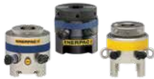
HydraMax, General Purpose and Aquajack® Subsea Tensioners