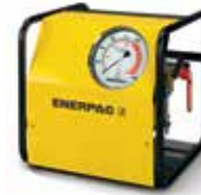
Pneumatic Tensioning Pumps