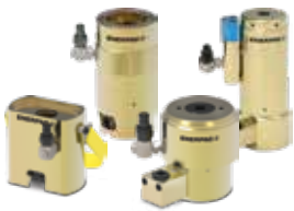
Power Generation Bolt Tensioners