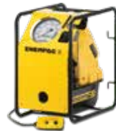
Electric Tensioning Pumps