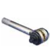
Manual Torque Multipliers