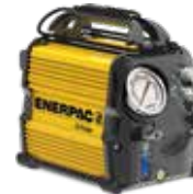
Electric Torque Wrench Pumps