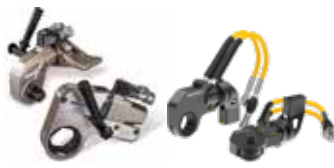
S, W, RSL and DSX-Series Hydraulic Torque Wrenches