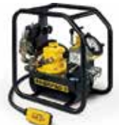
Pneumatic Torque Wrench Pumps