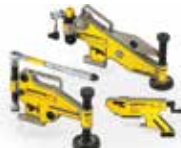
Flange Alignment Tools