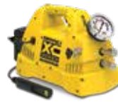
Battery-Powered Torque Wrench Pumps