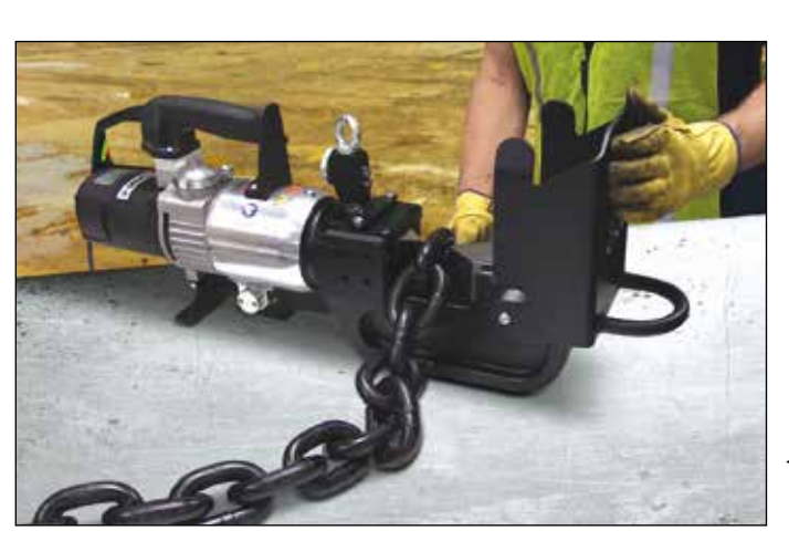
Cut through chain links with ease using Enerpac's chain cutters.