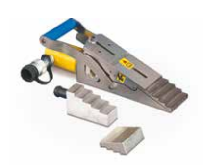
LW-Series, Lifting Wedges