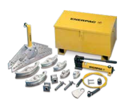
STB-Series, Pipe Benders