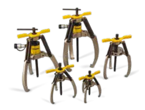
LG-Series, Lock-Grip Pullers